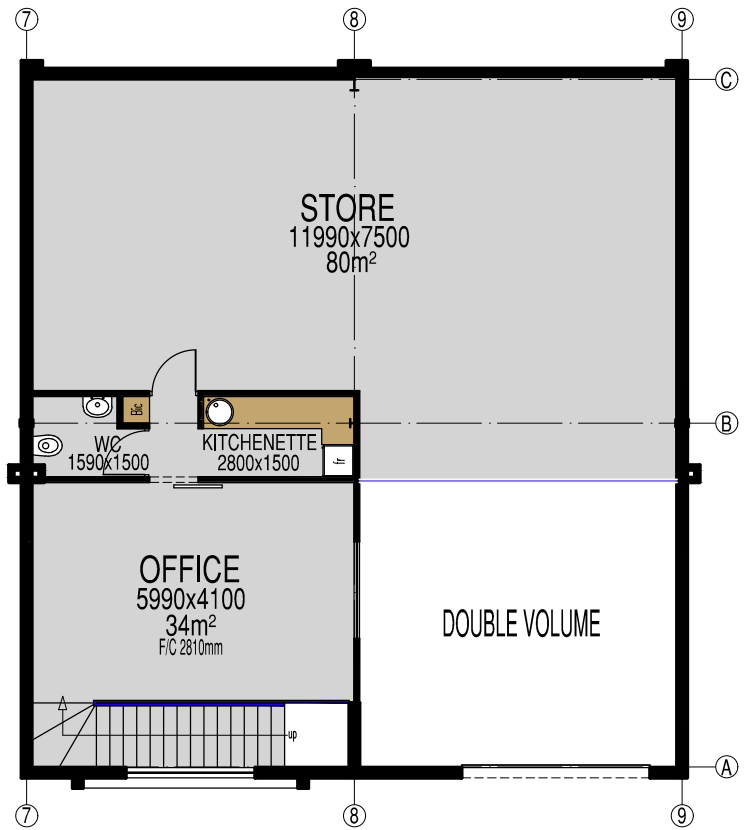
FIRST STOREY NOT TO SCALE